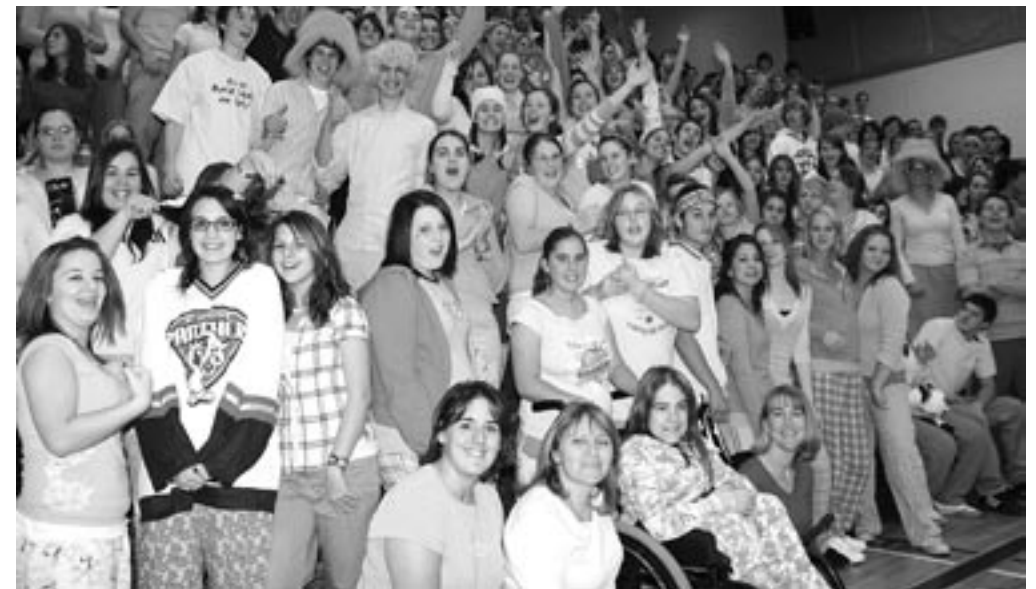
St. Joseph’s CSS shows their true colours by wearing pink to raise anti-bullying awareness.

Some attribute the spirit to join the cause to the family aspect recognized at St. Joseph’s. Students explained that it shows how much we all need to depend on one another and that like a family, when one person is being hurt, it hurts everyone.