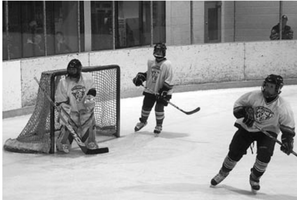
St. George's players defend their end in their annual game against St. Andrew's

This is the tenth year that St. George's has played in an annual hockey game to help raise school spirit. St. Andrew's became the official opponent last year and hopes to get the win in January, 2009.