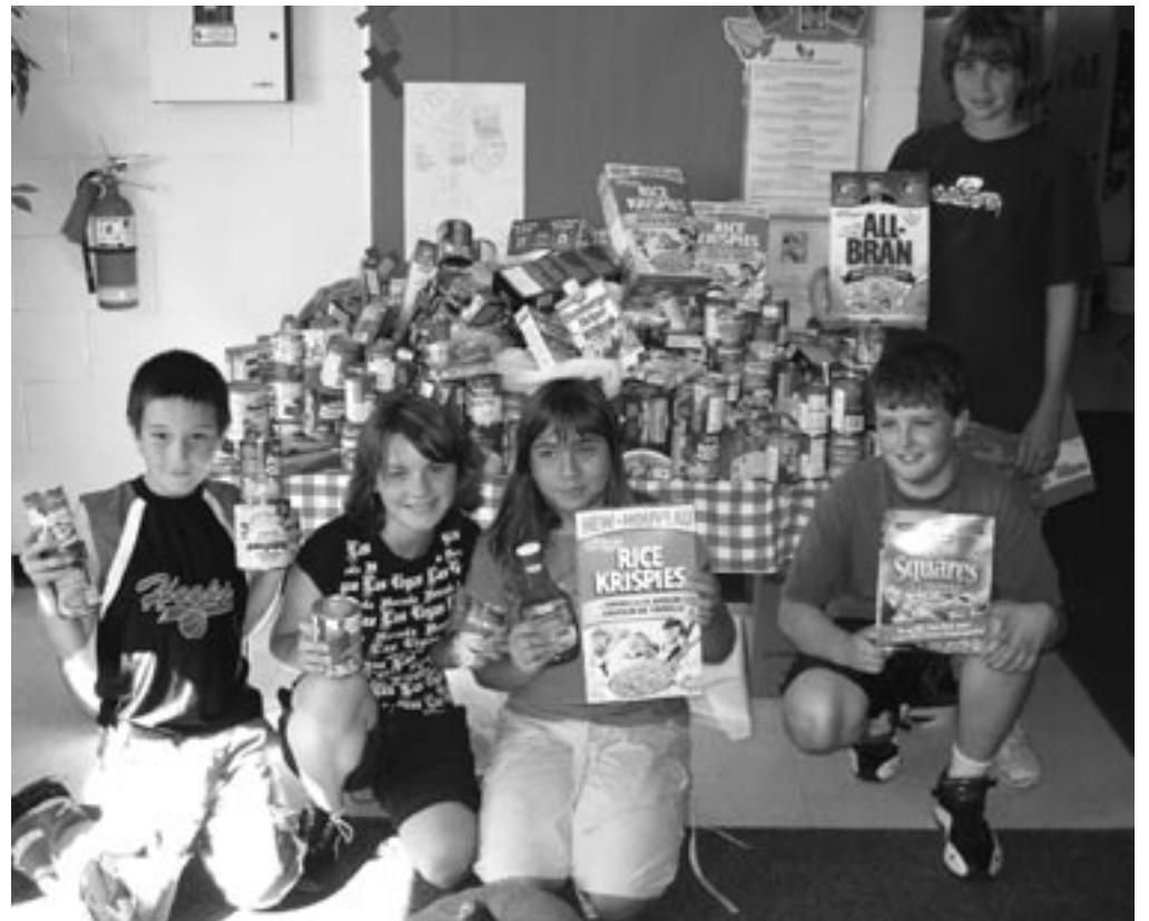
Students from St. Joseph Catholic School in Toledo display food drive donations