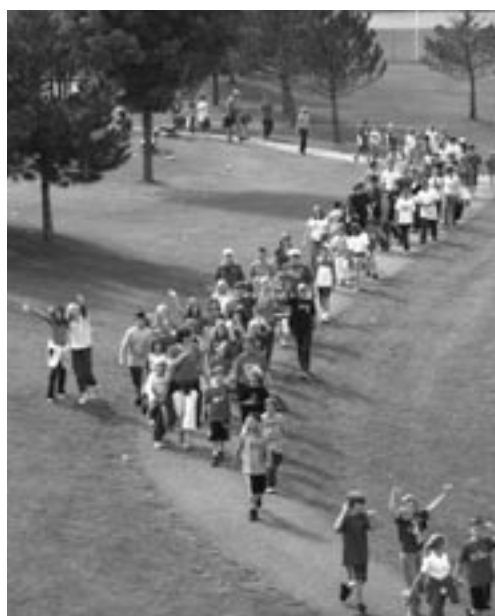
Students from St. John Catholic School, Perth

Secondary students did their part too. At St. Francis Xavier CHS in Hammond, students rallied together and collected close to $4600 for the cause. Rain couldn't hinder the Panther pride at St. Joseph's CSS in Cornwall; they moved their run indoors and collected close to $3000. In Carleton Place, Notre Dame CHS students had excellent results with more than $2500 in donations.