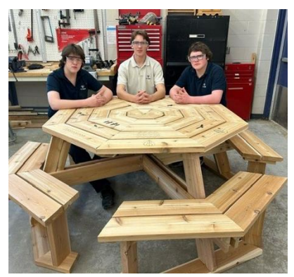
Students Construct Picnic Tables for Healing Place Garden